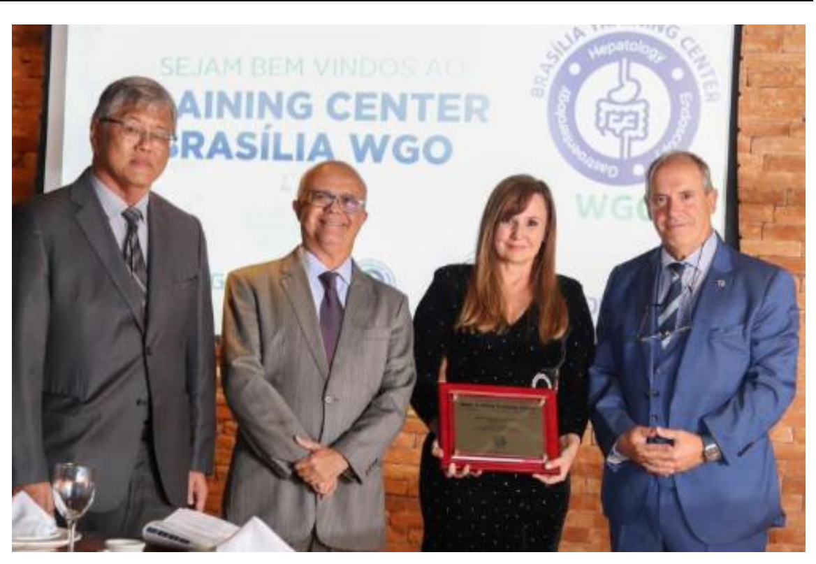
BrasiliaTraining Center: Training Center in Brasilia was inaugurated as a World Gastroenterology Organisation (WGO) Training Center on July 15<sup>th</sup>, 2023.