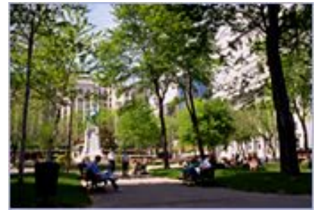
Dorchester Square, Montreal