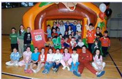
Local children take part in World Digestive Health Day Activities

To commemorate World Digestive Health Day 2005, the Alimentary Pharmabiotic Centre (APC) a Research Centre focusing on gastrointestinal health and based at University College Cork (UCC), put its own advice into practice and organized Live the Good Life – You Are What You Eat And What You Do Family Fun Evening at the University College Cork's Mardyke Arena.