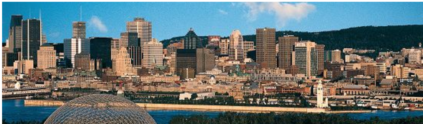
Montreal Skyline