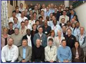
TTT Participants 2006

From 31 July - 5 August, the 6th annual Train the Trainers workshop took place in Port Elizabeth, South Africa. Representatives from 19 countries and five continents participated. WGO-OMGE considers Train the Trainers to be one of a number of tangible contributions to the activities of the member national societies, and thus annually seeks nominations from the societies for TTT participants.