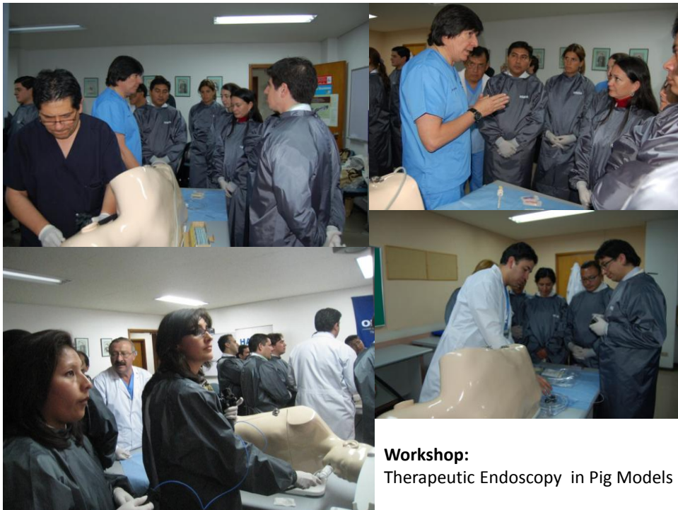
Workshop: Therapeutic Endoscopy in Pig Models