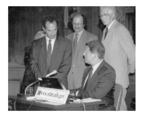
Fig. 1 June 26, 1997: the first search of PubMed, by Vice-President Al Gore at the U.S. Capitol. (PD) Photo: National Center for Biotechnology Information.

Alternatively, you can type a few keywords into the PubMed search box—e.g., to look for articles that have the words "enteritis" or "inflammatory bowel" in the title field, and then view the indexing for this record. This way you are also likely to find the relevant MeSH term "inflammatory bowel diseases.