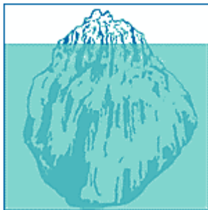
Fig. 1 The celiac iceberg

Richard Logan first published the concept of the celiac iceberg in 1991. In Europe, for every case of celiac disease diagnosed on clinical suspicion, there would be many that remained undiagnosed — either because they were latent, silent, misdiagnosed, or asymptomatic. The ratio of diagnosed to undiagnosed CD in Europe is around 5 : 1 to 13 : 1.